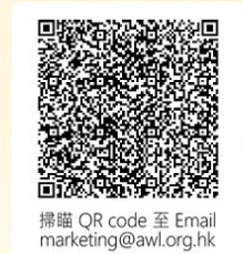
掃碼 QR code 至 Email marketing@awl.org.hk